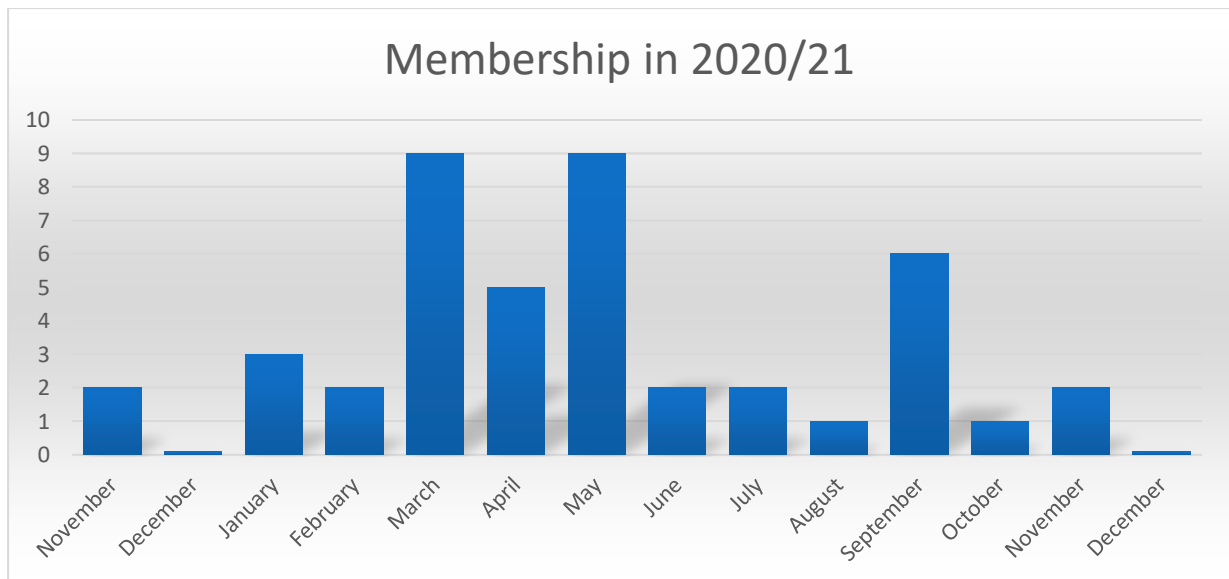
Fig 1. Membership payments for 2020/2021

As of December 2021, the IAQAA had 47 fully paid members.