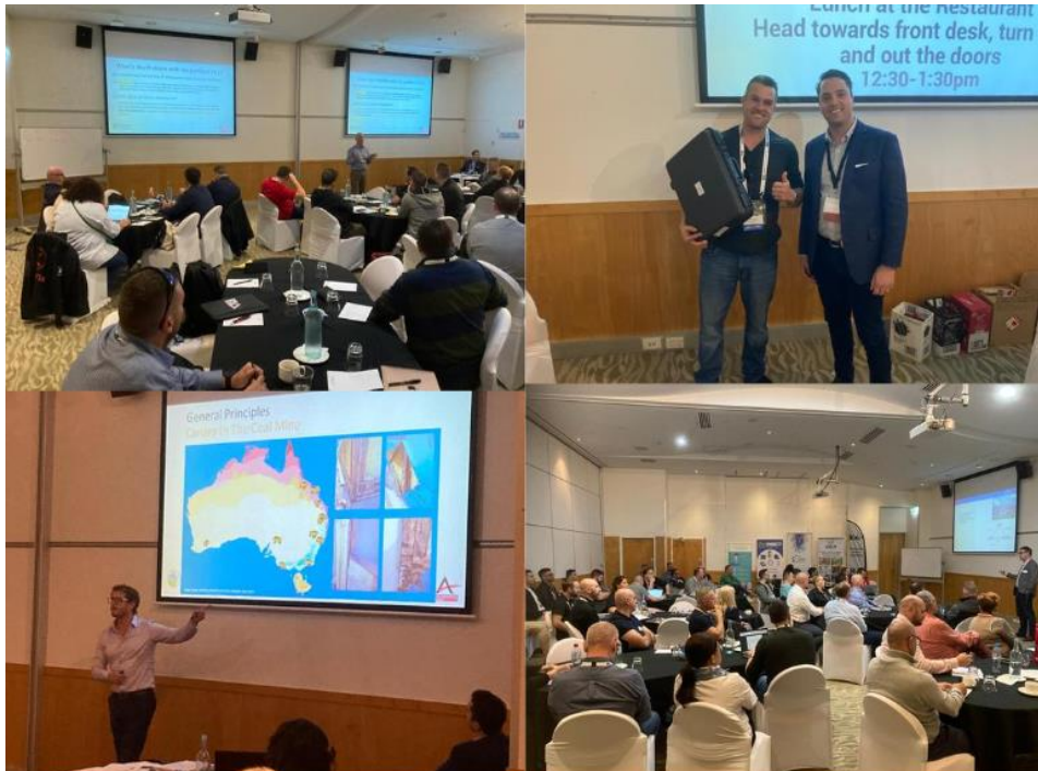
Environmental Day QLD 25 May 2022