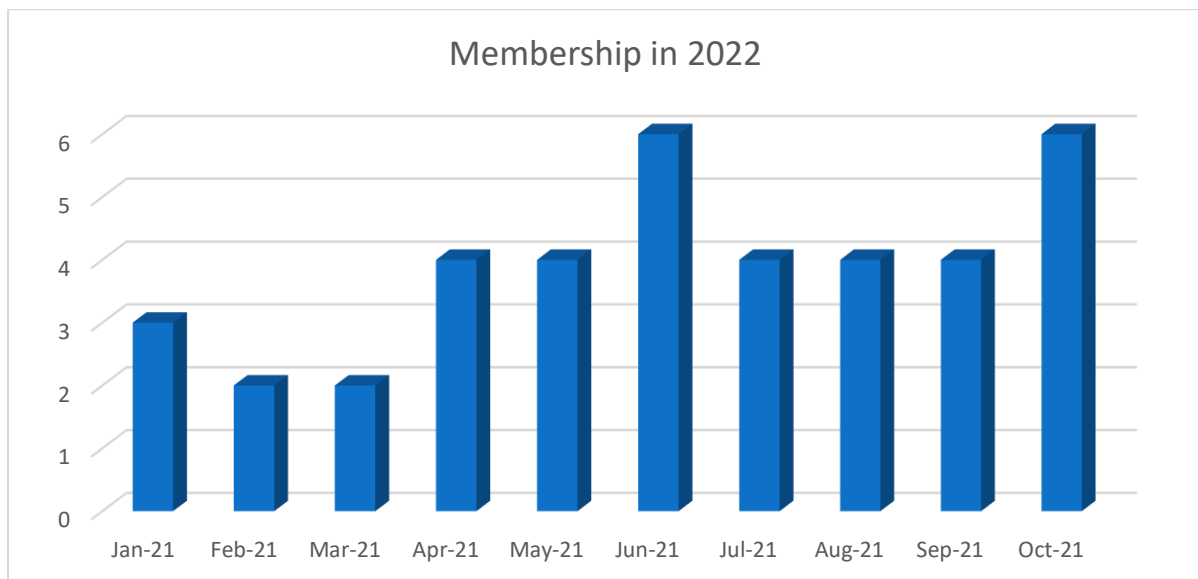
Fig. 1 Membership payments in 2022

The IAQAA still offers free membership to student and government individuals, and we promote a discount to members of the IAQA USA chapter members.